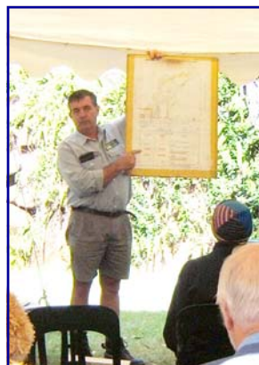
Managing Fire and Native Vegetation Workshop presented excellent information to attendees