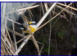
Colourful, elusive striped pardalote