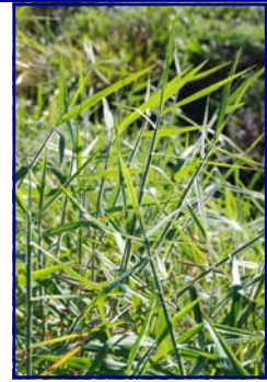
Para Grass (Urochloa mutica)

Also named as brachiaria mutica , para grass though a pasture grass is a serious weed in native wetlands. It destroys waterbird breeding habitats and replaces native vegetation in tropical and sub-tropical streams.