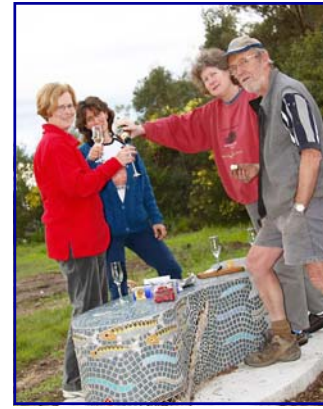
Celebrants at unofficial opening of Osborne Road Greenway Bridge, Sculptures and Artworks

Love our catchment? So do we. Help us keep our KBCB Catchment Branch and Network ticking along. Join our committee as Secretary... We'd enjoy your company. Contact our President (as above) for details