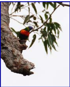
Rainbow lorikeet watches from nest