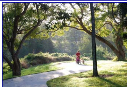
Morning stroll on Mitchelton Greenway

Mitchelton Centre was identified as part of the CityShape 2026 process when 60,000 Brisbane residents had a say in where growth should be accommodated across the city. The area was seen as appropriate for increased residential density living as it has a busy shopping precinct, Brookside Shopping Centre, is situated along a key transport corridor, and is expected to be a high employment growth area.