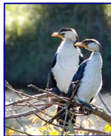
Pied Cormorants looking for dinner

It's a lovely way to see the Brook. (C1)