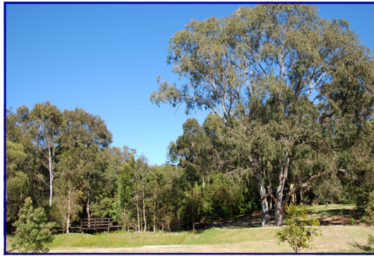
Magnificent Grange Forest Park

Our next branch meeting will include an update from the other major work in progress, the Gateway Duplication. It won't be long before a six-lane highway flies over the water in the wetlands, and we shall hear what strategies are being used to ameliorate environmental impacts of such a huge intrusion. It may strike some of us as ironic that just as we notice climate change begin to affect us with shifting weather patterns we are spending hugely on infrastructure to support one of the major culprits in greenhouse gas