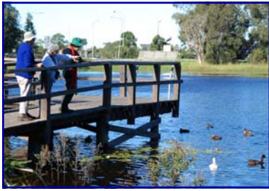
Counting the water ducks at Nudgee waterhole

Along the way you get to see other environmental influences as well. Would you believe it that the Zion Hill Cemetery is a