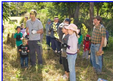
Volunteers receive their planting instructions at the Ferny Grove planting