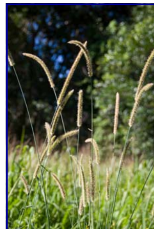
Pigeon Grass ( Setaria sphacelata )

An imported pasture grass, naturalised in Moreton Bay region, a significant weed in wetland and moist areas.