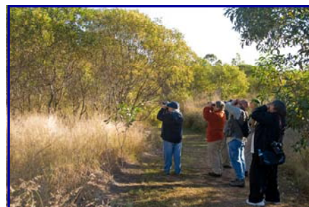
Kedron Brook birders looking at Double-barred Finches on the July bird survey at Grange Forest Park, Sunday 3 July