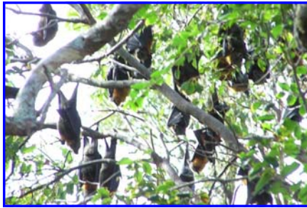
‘As native mammals, and pollinators and seed dispersers, flying-foxes are important too and should be conserved’

I have consistently called for increased research into environmental issues. Armed with better knowledge we can not only enjoy what we observe much more (think of watching a game on tele without knowing the rules) but more importantly can make and call for better