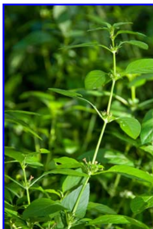
Dychoriste depressa is spreading vigorously from adjacent contract-mowed lawns, contaminated from other parkland cuttings