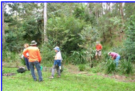
Moreton Bay Rovers assist Wahminda Grove Bushcare Group on 7 June