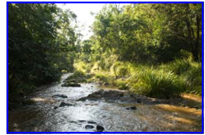
This reserve won’t raise a fortune and that’s because it’s free but even this is dependant upon continued support from our community and governments