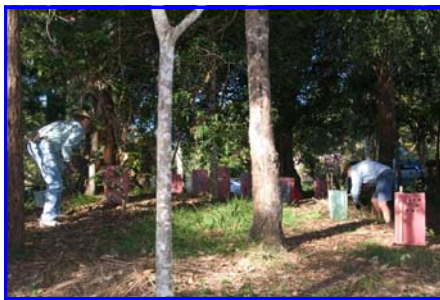
Greenbrook Association weeding over recently revegetated areas, June 2011

This adjacent work group tends to work more along the eastern section of the Grange Forest Park, mostly north of