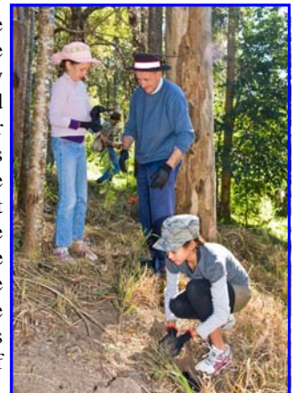
Lots of young planters helped

Habitat Brisbane group, the community survey team and many other local residents gathered to take action to protect and consolidate the habitat where these native animals were found. This consisted of planting over