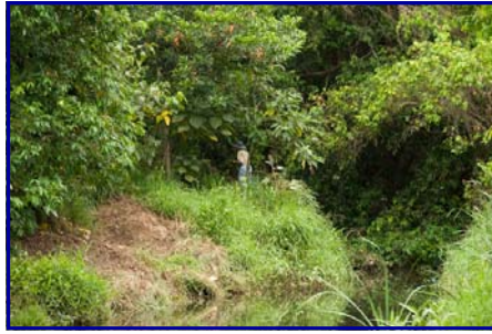
Some areas are deeply covered in trees

The group regularly work to rehabilitate the southern creek bank and flood-plain of the stream using the nucleus of remnant native vegetation, including some superb Waterhousia floribunda (Weeping Lillypilly tree).