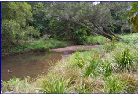
Other areas are more open

In the planning stages, and subsequently,