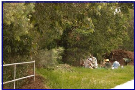
They make a great cuppa tea at the end!