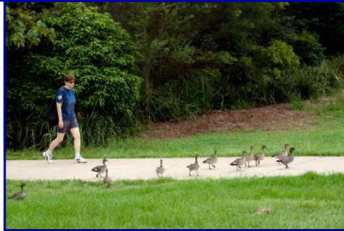
This chain of Australian Wood-ducks stopped the bikers and walkers at Dawson Parade recently. Ma and Pa duck guarded both ends.

We should be calling for remedial action on all such issues and supporting those already in hand – replanting, pervious paving, water sensitive urban design, retention of woodland, weed