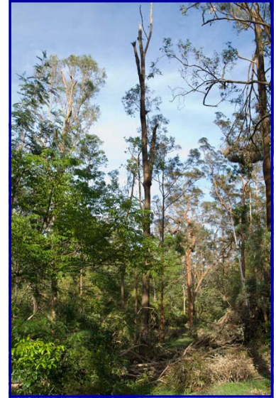
Afterwards, trees stripped or fallen

(Dawson Parade Bushcare Grp continued from page 3)