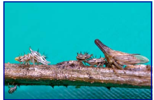
Female stem-sucking bug (Aconophora compressa) shown right , tending her nymphs on lantana at the Weed Workshop, 9 Nov. 08.