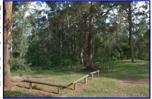
Before the onslaught at Wahminda Grove