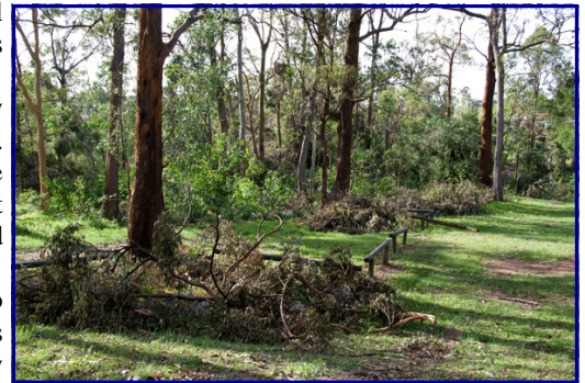
After the storm, the reduction in leaf density, in numbers of branches per tree and of standing trees produces a harsh-looking forest