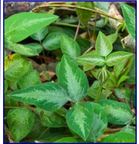
Silver-leaved Desmodium ( Desmodium uncinatum )

A Class R environmental weed under local Council regulation, this perennial vine was brought in from South America as a pasture plant and is now apparently naturalised. (Yep! We're stuck with it!)