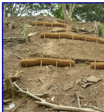
Coir logs stabilize the slopes in Kalinga Park, adjacent to Carew Street. (EM)

Extending downstream from this area, weed control has extended to the