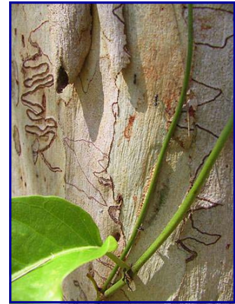
Native climber over Scribbly Gum trunk