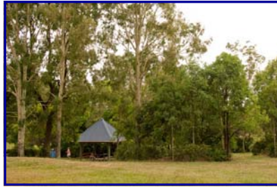
Grinstead Park has a well-established remnant forest area

There is habitat for small birds and butterflies to