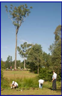
Corporate support supplements regular group activities

At first, native grasses and eucalypt seedlings emerged in dry conditions; the regeneration area was then extended.