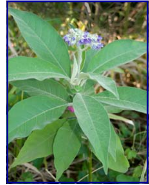
Wild tobacco ( Solanum mauritianum )

Beloved by flying foxes and native birds that spread the seeds, this plant propagates easily and out-competes natural vegetation in disturbed areas.