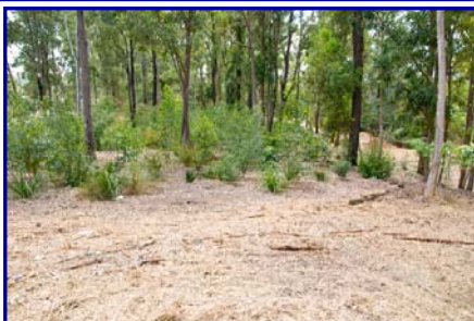
BCC recently removed weeds from large areas of Arbor Park. It looks bare compared with the planted plot behind.

One key finding, amongst others, was that, "Generally, there is little opposition from the general community to mountain bike riding in Council bushland areas. This suggests any program to encourage