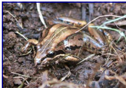
Striped Marshfrog

DO YOU WANT MORE OUT OF LIFE? Why not give more of yourself to help us save our environment together? Many hands make light work and your assistance with planning, secretarial, or implementation activities would greatly assist our valiant few. Act now... or it could all stop.