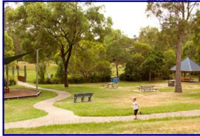
One strong feature for this eager child is the great children's playground